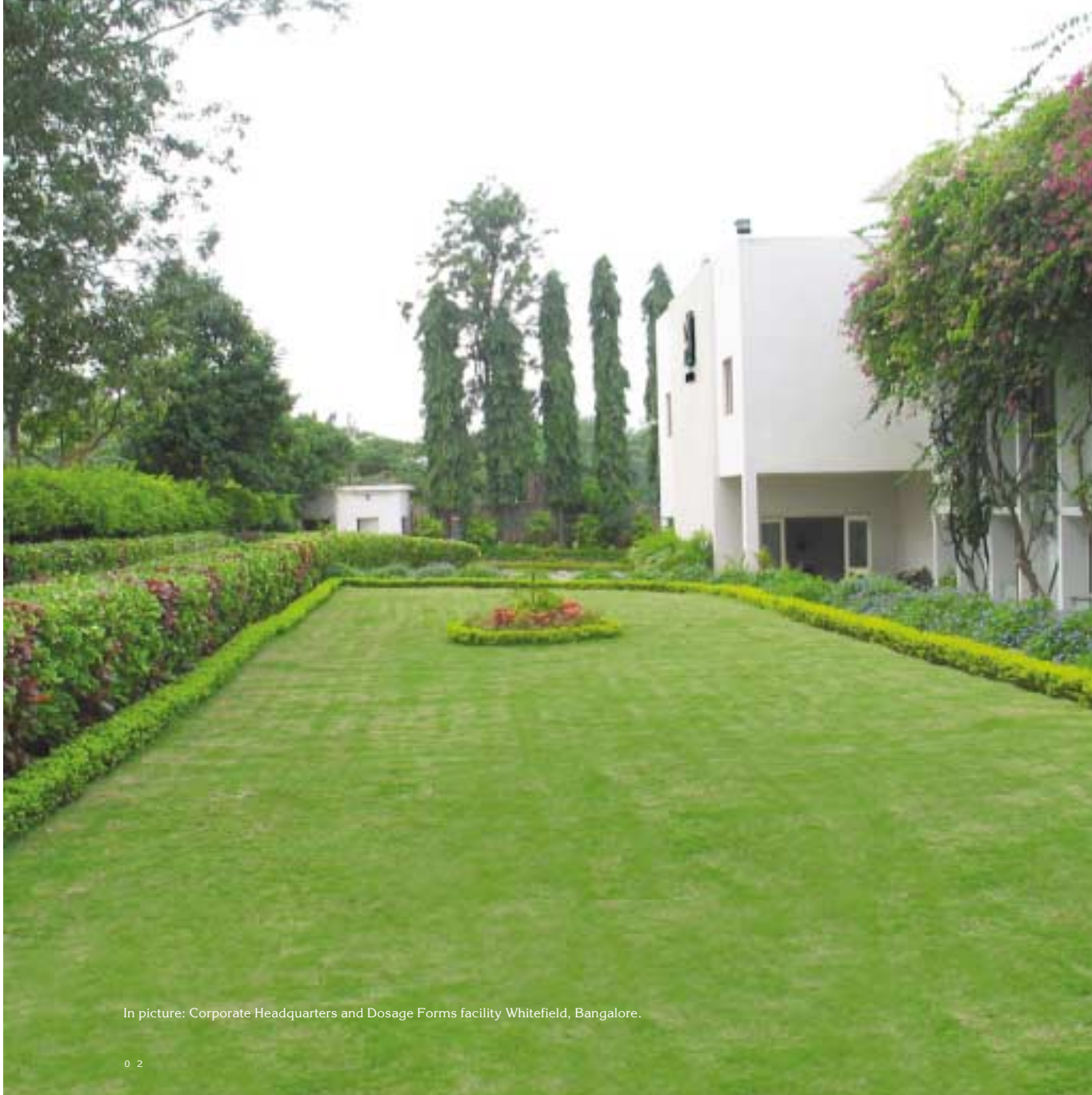
In picture: Corporate Headquarters and Dosage Forms facility Whitefield, Bangalore.