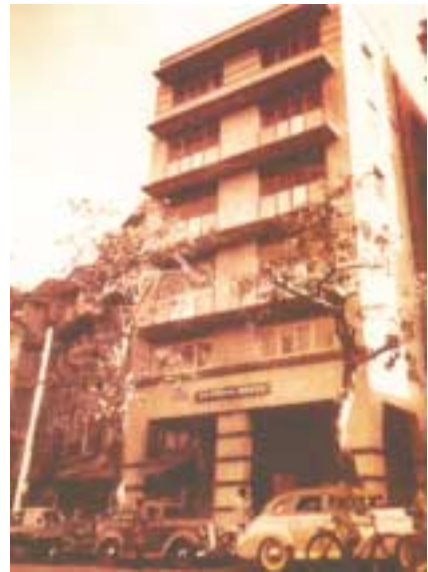
In Picture- Pharmed House Bombay, circa 1950s

Retrospecting on our moments of pride, we feel great pleasure to emphasize that Pharmed has been the pioneer of anti-TB therapy in India way back during the '60s. Our other moments of glory include introduction of first-time-in-India molecules such as Calcium Citrate (SUPRACAL), Glucosamine (CARTIGEN), pre- & pro-biotic combination-Lactobacilli with Fructooligosaccharides (LAFF) etc.