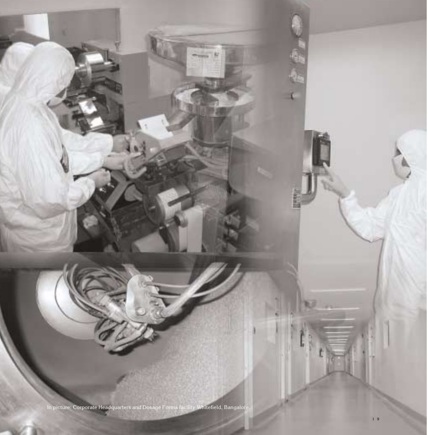
In picture: Corporate Headquarters and Dosage Forms facility Whitefield, Bangalore.