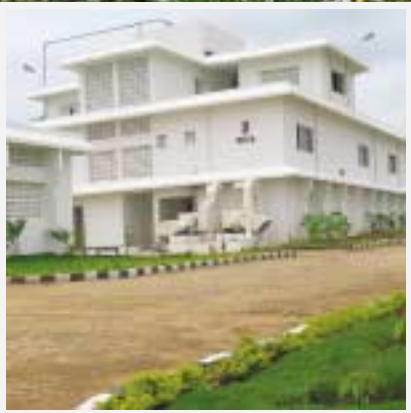
In picture: API manufacturing and research facility.